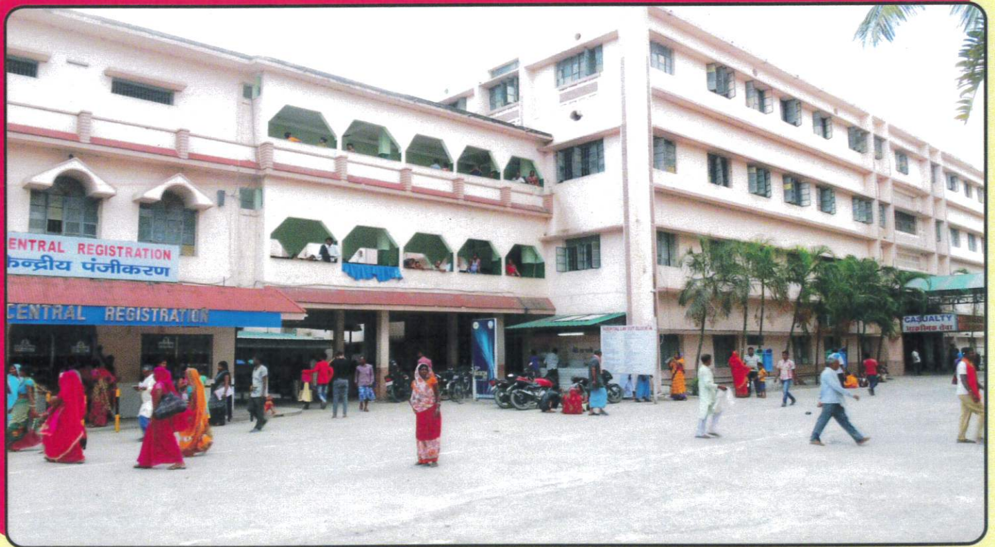
CENTRAL REGISTRATION AND CASUALTY