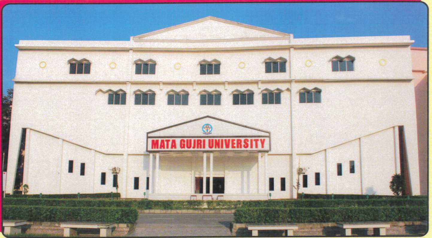
BABA FARID LECTURE THEATRES CUM CENTRAL EXAMINATION HALL