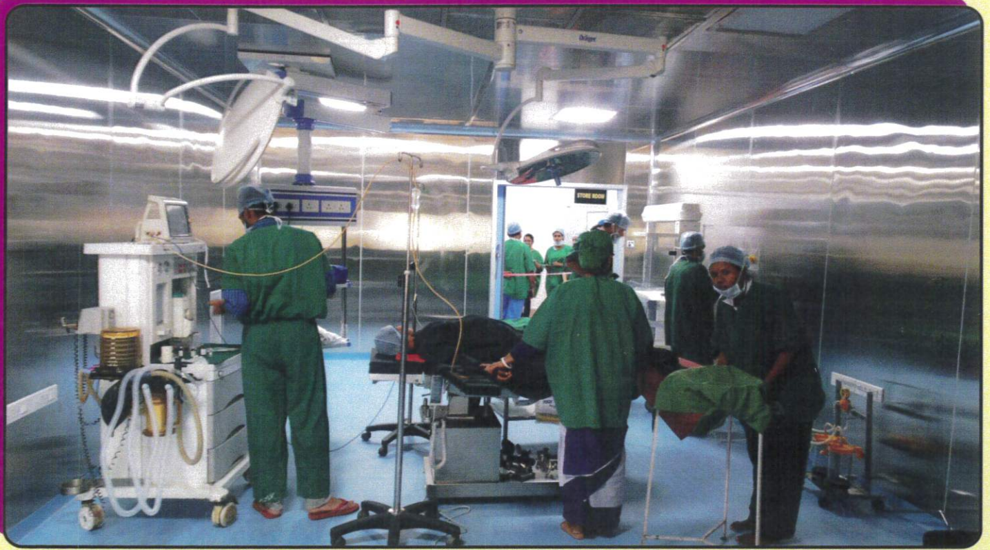
MODULAR GYNAE O.T.