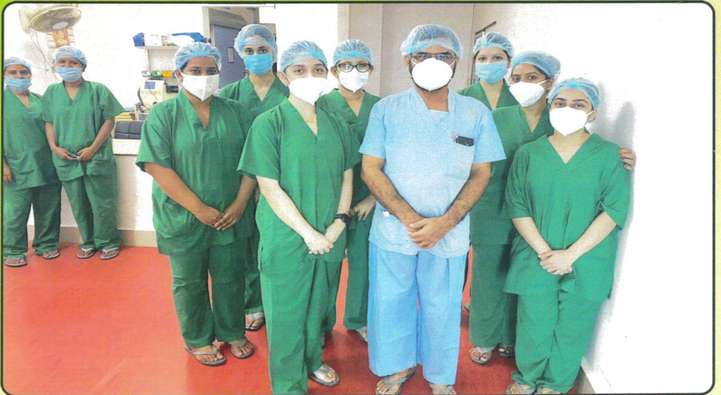
MODULAR GYNAE O.T. COMPLEX