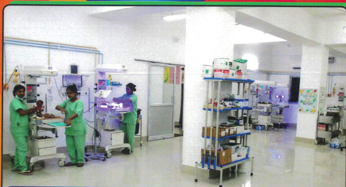
MODERN NEONATAL INTENSIVE CARE UNIT